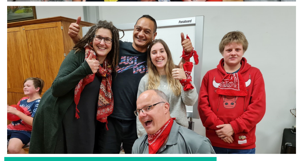
DEAFinitely Canterbury News Page 6