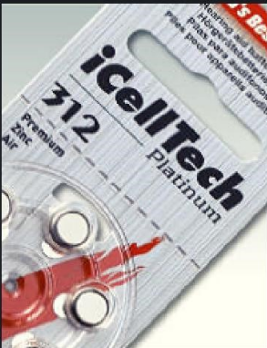
Batteries from $39.95