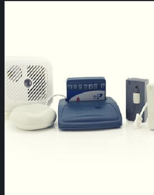
Alarms for Work