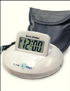
Travel Alarm Clocks