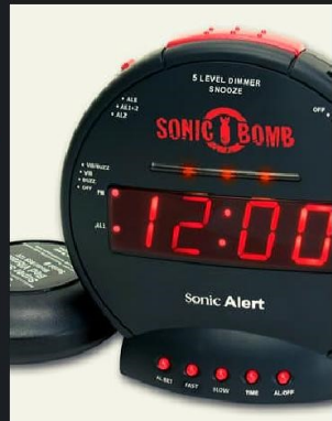
Vibrating Alarm Clocks