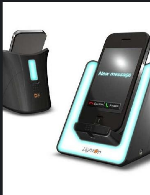
Mobile Phone Signaler